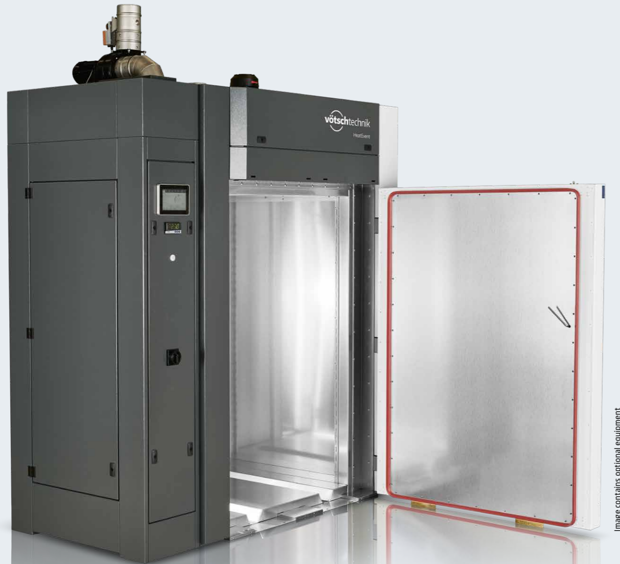
Image contains optional equipment

Optional equipment for individual solutions.